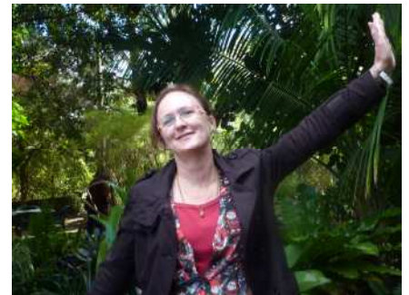
Me!! I’m flying